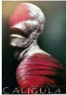
Caligula by Albert Camus October 31, November 1, 7 & 8