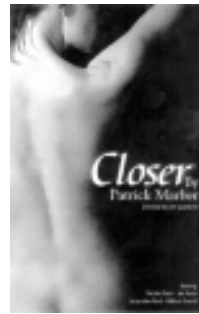
Closer by Patrick Marber February 20, 21, 27 & 28