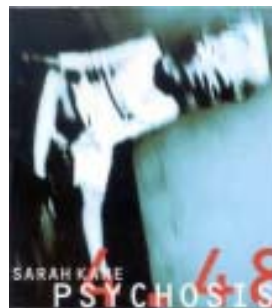
4.48 Psychosis by Sarah Kane June 18, 19, 25 & 26